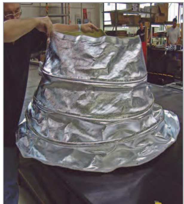
Fabric bellow - sample of larger size