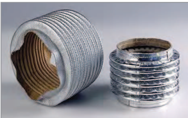
Fabric bellow coated with Alu/Glass fibre coating

Nevertheless, the supporting fabric changes the character of the surface, so that the smoothness of the rubber disk type is lost.